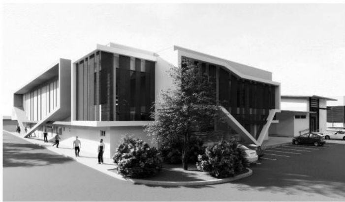
01 PERSPECTIVE A-01 SCALE